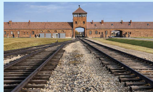
Auschwitz concentration camp, Poland

The United Nations adopted this day with Resolution 60/7, urging every member nation of the U.N. to honor the victims of the Holocaust and develop educational programs about its history to help prevent future acts of genocide. It rejects any denial of the Holocaust and condemns all manifestations of religious intolerance, incitement, harassment or violence against persons or communities based on ethnic origin or religious belief. It also calls for actively preserving the Holocaust sites that served as Nazi death camps, concentration camps, forced labor camps, and prisons. The essence of the text is intended to ensure remembrance of those murdered and educate future generations.